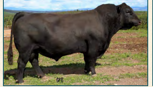
Bar-E-L Natural Law 52Y Sire

Retaining in herd semen interest. Terms to be announced sale day.