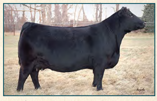
PM Rosebud 77'15 Full Sibling